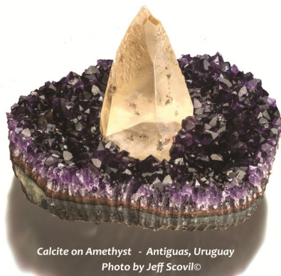
Calcite on Amethyst - Antiguas, Uruguay

Like us on Facebook ~ facebook.com/mzexpos